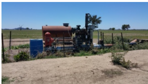
Syerston's Western Borefield

A water pipeline will be constructed for the project, providing water from the borefields in the south to the mine site, as well as the limestone quarry.