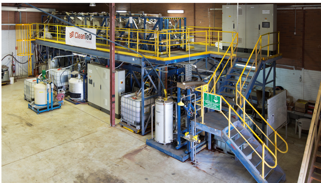
Clean TeQ's cRIP Pilot Plant in Perth, Australia

Development for Clean-iX ® for scandium has been carried out over 6 years, with an initial focus on recovery from titanium dioxide waste streams, where the majority of scandium is sourced today. This work culminated in operation of a large-scale scandium recovery pilot plant to a major Japanese titanium dioxide producer in 2015. Subsequently, a large-scale pilot plant campaign was carried out in 2015 on Syerston ore to produce scandium oxide samples for potential customers.