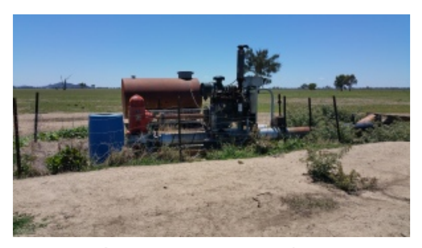
Syerston's Western Borefield

A water pipeline will be constructed for the project, providing water from the borefields in the south to the mine site, as well as the limestone quarry.