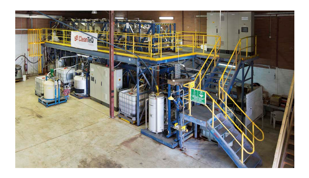
Clean TeQ's cRIP Pilot Plant in Perth, Australia

Development for Clean-iX® for scandium has been carried out over 6 years, with an initial focus on recovery from titanium dioxide waste streams, where the majority of scandium is sourced today. This work culminated in operation of a large-scale scandium recovery pilot plant to a major Japanese titanium dioxide producer in 2015. Subsequently, a large-scale pilot plant campaign was carried out in 2015 on Syerston ore to produce scandium oxide samples for potential customers.